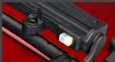
Integrated dimmer switch, Universal Mounting Tabs