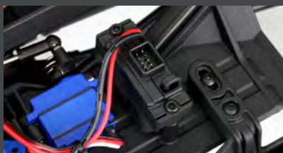
LED Lighting Module Installed